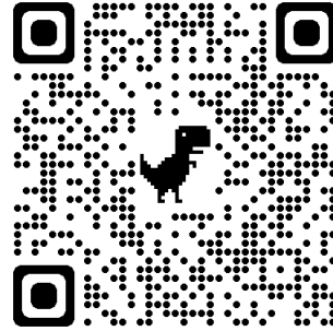
Au Sable River Valley Business Association

The Au Sable River Valley Business Association is organized to achieve these objectives: Fostering business and community growth and development through economic programs designed to strengthen and expand the income potential of all businesses in the trade area; promoting programs of a civic, social, and cultural nature that are designed to increase the functional and aesthetic values of the community.